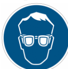
Tightly sealed goggles